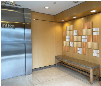
*This is not the actual donor wall design.

The Bermuda Foundation will be installing a donor recognition wall in the foyer of the award-winning Sterling House building, its permanent home.